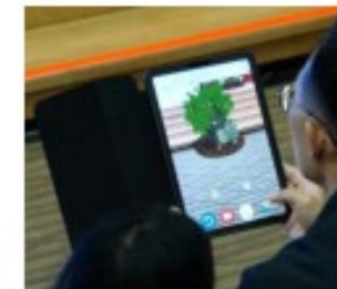
TL Digital Resource: AR Experience