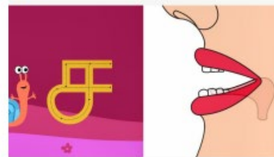
TL Digital Resource: Tongue Placement Videos