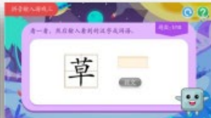
CL Digital Resource: Hanyu Pinyin Games