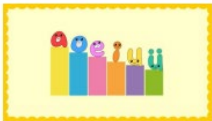
CL Digital Resource: Hanyu Pinyin Animation

Use of technology to sustain interest and encourage self-directed learning