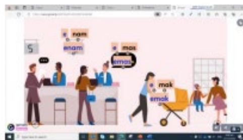
ML Digital Resource: Bridging Videos