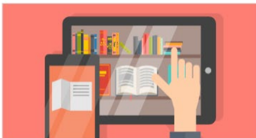
知识·悦读 电子周刊 Zhishi.Funland Reading E-Magazine