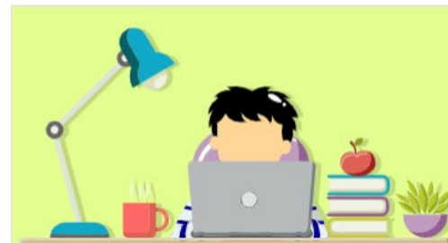
电子作业与网上练习 eAssignment & eExercise