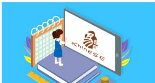
易·华文 动画周刊 eChinese Syllabus-Align E-Magazine

数码辅助教学 / 居家学习资源 ICT TEACHING & HOME-BASED LEARNING RESOURCES